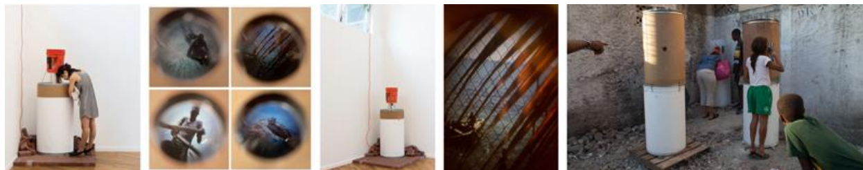
Images (L to R): 1) Diorama (2018), As Above, So Below, Installation Documentation (Detail), Outpost Artist Resource, New York, NY; 2) Interior Barrel Detail, Installation Documentation, Outpost Artist Resource, New York, NY; 3) Diorama (2018), As Above, So Below, Installation Documentation (Detail), Outpost Artist Resource, New York, NY; 4) Interior Barrel Detail, Installation Documentation, Outpost Artist Resource, New York, NY; 5) Ghetto Biennale 2018, Installation Documentation, Port-Au-Prince, Haiti; All images courtesy of the artist.

Café at The Arts Center at Governors Island