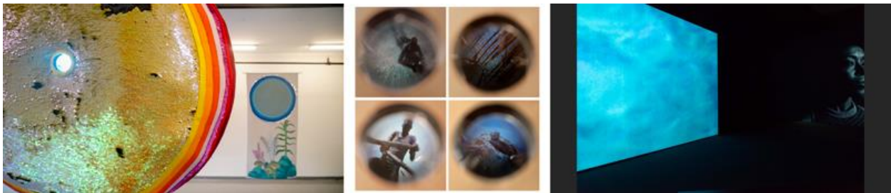
Images (L to R): 1) Foreground: Sun Blast (2021), Amy Khoshbin, Background: Soft Mural #3 (2021), Jennifer Khoshbin; 2) Simon Benjamin: Diorama (2018), Interior Barrel Detail, Installation Documentation, Outpost Artist Resource, New York, NY; 3) Back and Song, Still/Installation View (Detail); All images courtesy of the artists.

ALL EVENTS AND PROGRAMMING ARE FREE, ALL ARE WELCOME