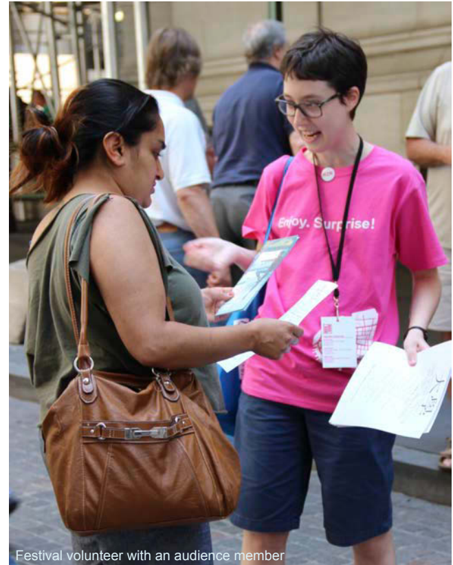
Festival volunteer with an audience member

In 2013, River To River staff worked closely with the more than 60 participating artists and arts groups, all of whom were selected based on their innovative practice and their interest and expertise in investigating space and architecture, inspiring an investigative spirit, and engaging communities. In an integrated approach, we worked one-on-one with each artist to gain an understanding of each project for River To River's own promotional purposes, and we also provided artists with toolkits to enhance their understanding of the Festival and enable co-promotion of their River To River participation. In the lead up to the Festival, staff also worked closely with artists by conducting site visits around Lower Manhattan to identify the right locations for their projects, taking into account the architecture of the surrounding environment, traffic patterns, and immediate ecosystem of workers, residents, and existing social and cultural activities.