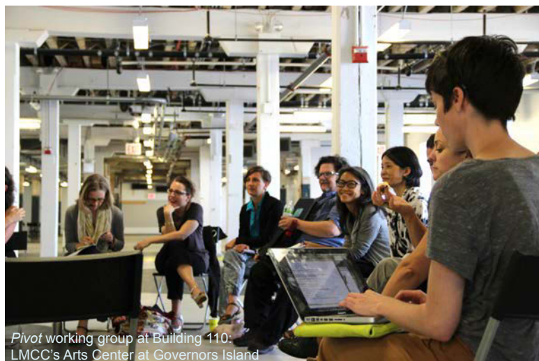
Pivot working group at Building 110: LMCC's Arts Center at Governors Island