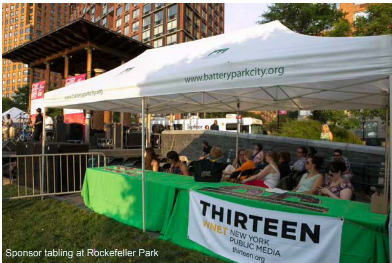
Sponsor tabling at Rockefeller Park

During the Festival, sponsors took advantage of these opportunities in various ways. Representatives from six sponsor companies activated tables and interacted with audience members at Rockefeller Park, Brookfield Place Plaza, and South Street Seaport. A group of summer interns from one sponsor company attended an evening concert together. Another sponsor organized an intimate post-show meet-and-greet with performer Laurie Anderson for its members.